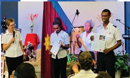
Above: This is the day I became a Salvation Army Soldier.