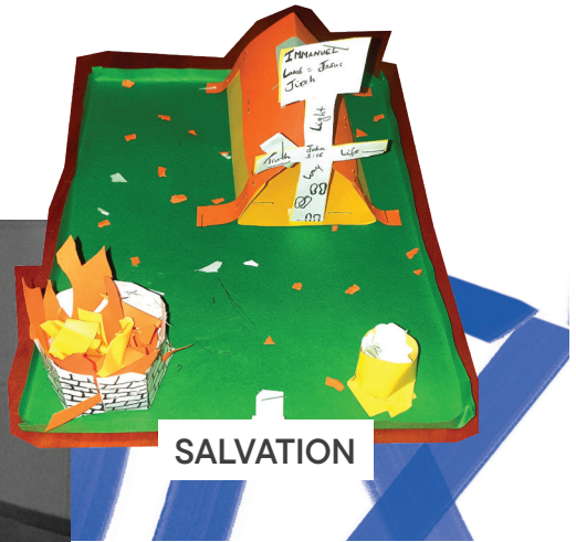
Above: My paper art depicts the Tabernacle of God and the cross, representing salvation through Jesus Christ.

The Tabernacle was the place where God dwelt among his people, the Israelites. It was a place for worship, forgiveness, blessing and a place to seek God's will. The Tabernacle held the Most Holy Place where God's presence dwelt and the Ark of the Covenant. It also held the Holy Place, plus there was also an altar for burnt offerings (outside the Tabernacle).